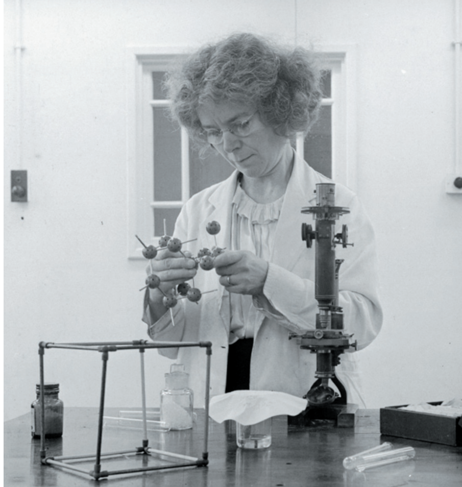
Pioneer: Kathleen Lonsdale was one of the first women to be elected to the Royal Society.